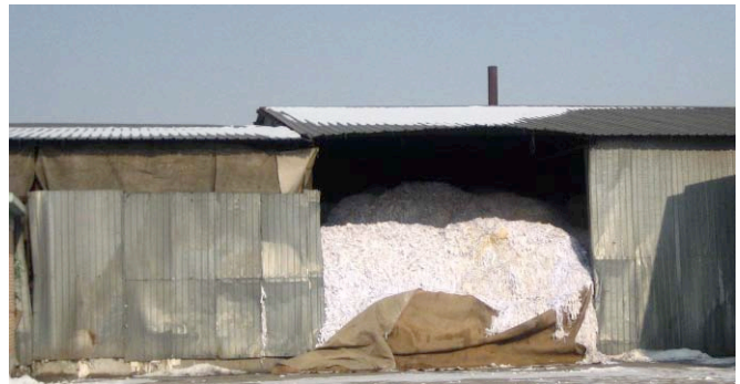
Side view of the recycled white scrap paper warehouse. The paper in view in the shed opening would have to be worth at least $500,000 if ONP's inventory numbers are to be believed.