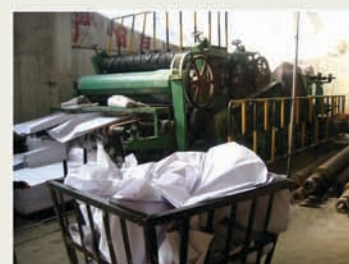
ONP - a sizeable quality gap.