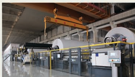
ONP "main competitor" Shandong Chenming Paper Holdings Ltd.