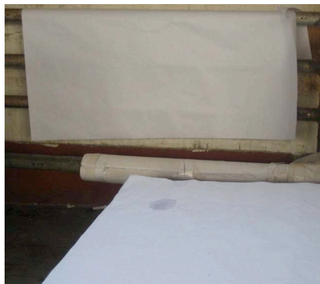
Amateur Hour at ONP. Note the water on the folding tables – and even on the paper being folded. Once paper is exposed to water, it is unsuitable for printing and loses strength.