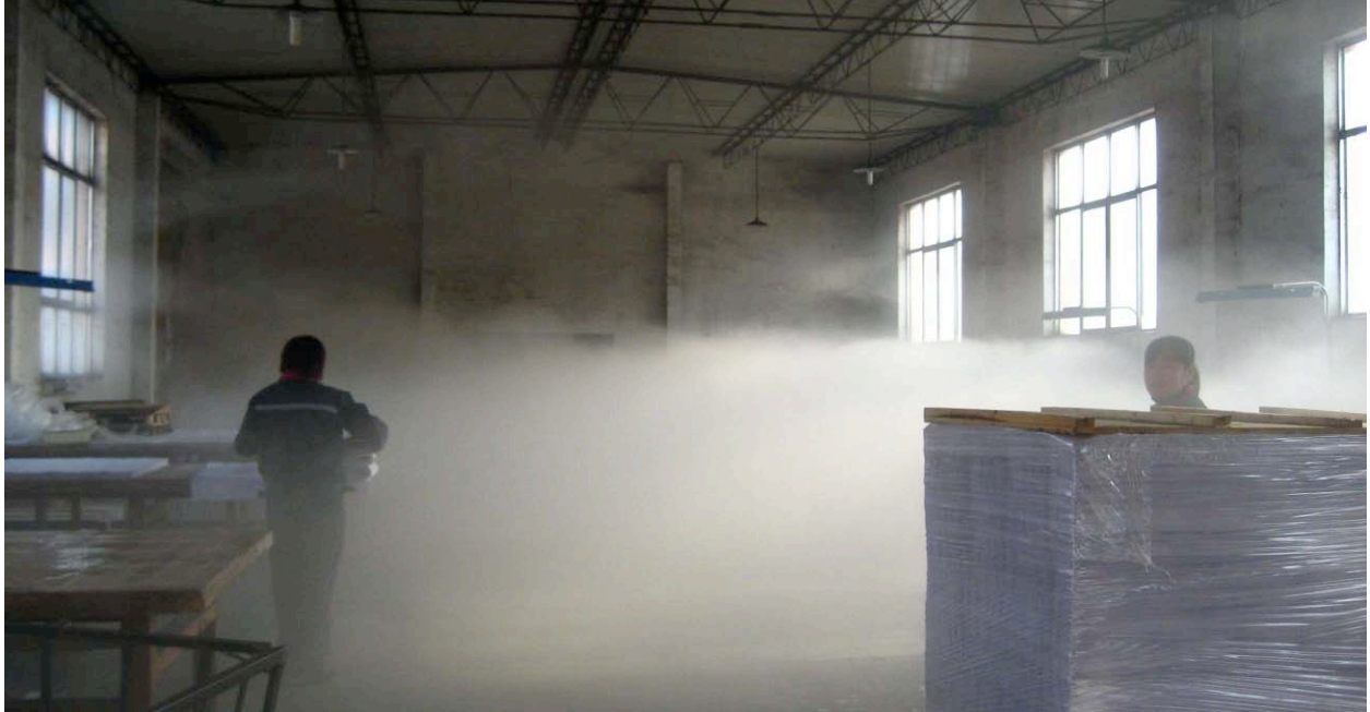
Where the water comes from – extensive steam in the workshop.