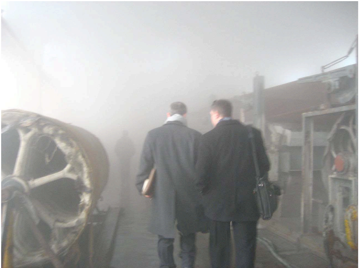
Even worse – the brown corrugating medium line that we suspect was not even producing anything.