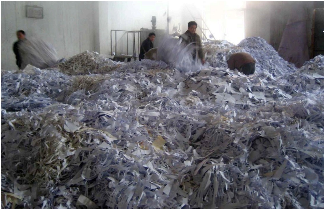
Workers gleefully playing in hundreds of thousands of dollars.

Taken together, the following three photos show the entirety of ONP's recycled white scrap paper inventory. Again, if this is worth $1.7 million, the world is a much richer place than we knew.