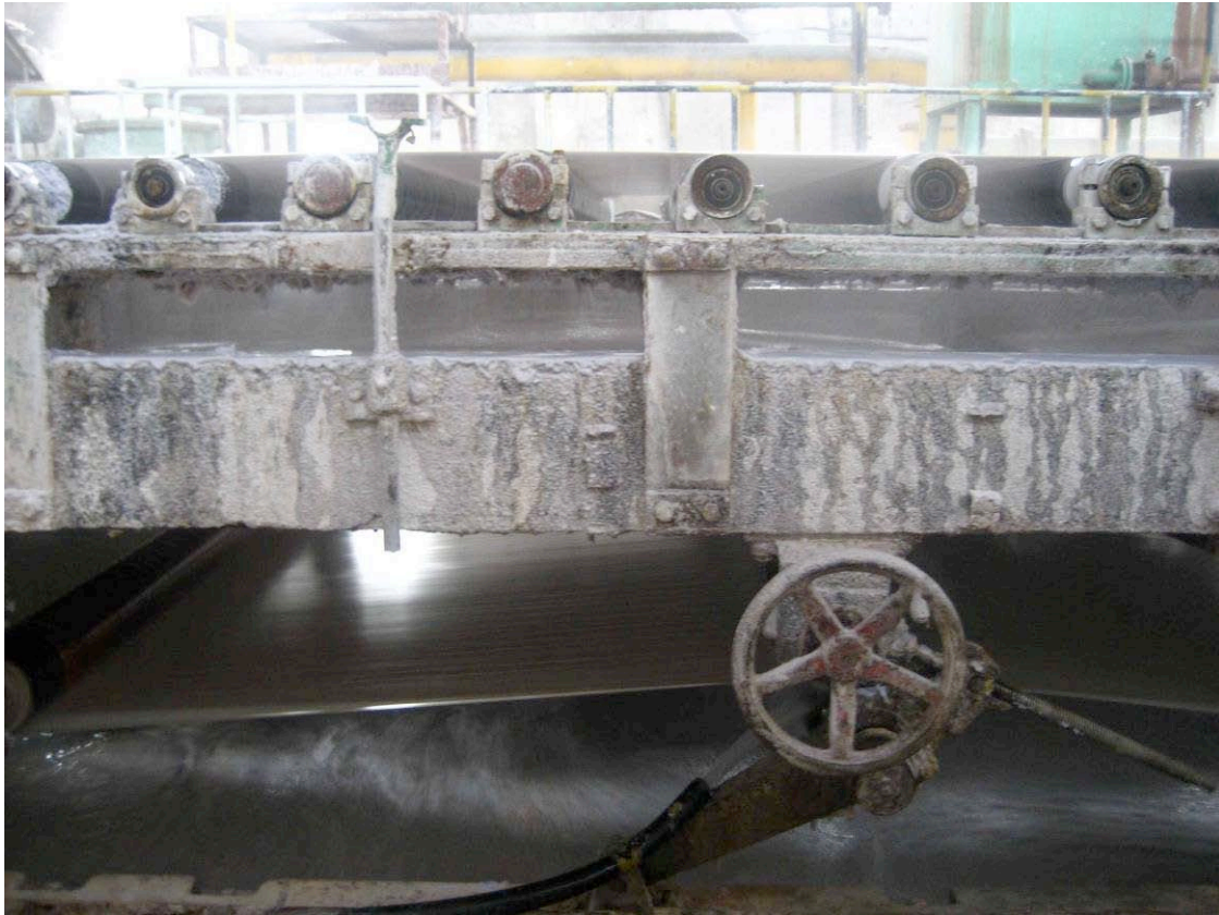
Age and poor maintenance are apparent in this close up of the white paper production line.